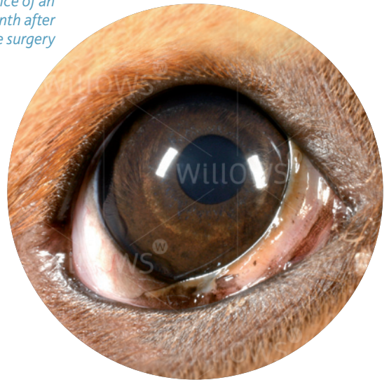
The appearance of an eye one month after corrective surgery