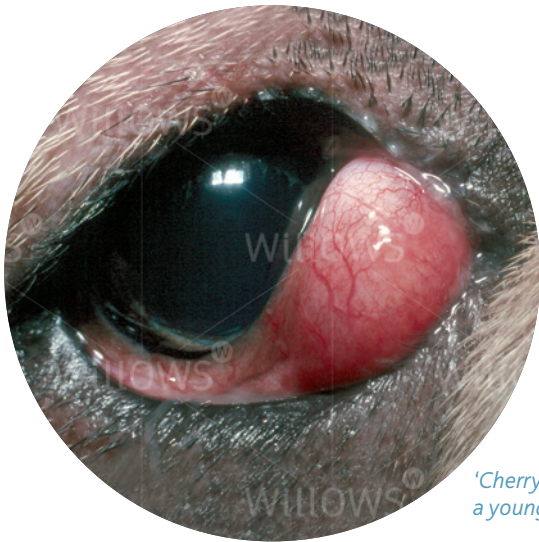
'Cherry eye' in a young Bulldog